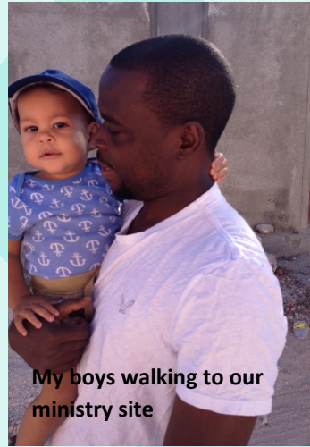
My boys walking to our ministry site